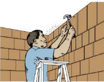
Figure 19: Top Course

Cut the Certi-label® Western Cedar shingles or shakes for the last course and discard the thin end. Glue or nail the last course in place to make a neat top edge. A moulding strip may be applied to cover nail heads and hide any irregularities in the ceiling ( Figure 19 ).