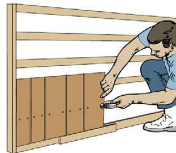
Figure 17: Starter Course