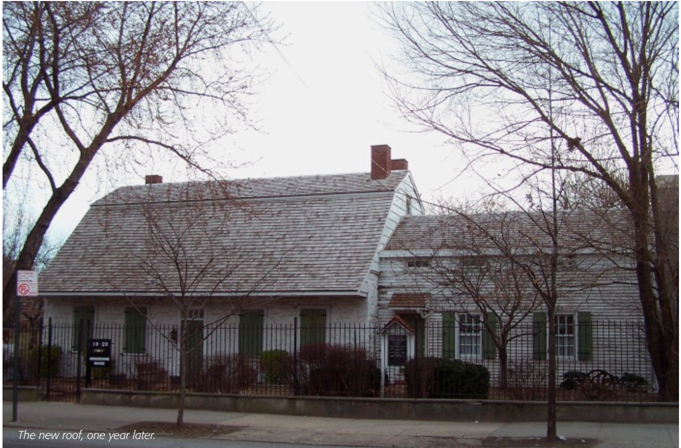
The new roof, one year later.

QUEENS, NEW YORK STATE: HISTORICAL HOUSE