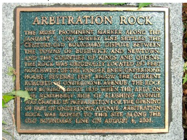
Plaque affixed to Arbitration Rock.

The farm site is home to "Arbitration Rock", a boulder that sits in the middle of the grounds behind the house. It was the original rock used to set the boundary between Bushwick, Brooklyn and Newtown, in the Borough of Queens.