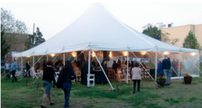
Enjoying the outdoor grounds.

A stringent in-house quality control team was developed for this special project. As the project's specifications called for Cedar Shake and Shingle Bureau ("CSSB") member Certi-label™ brand