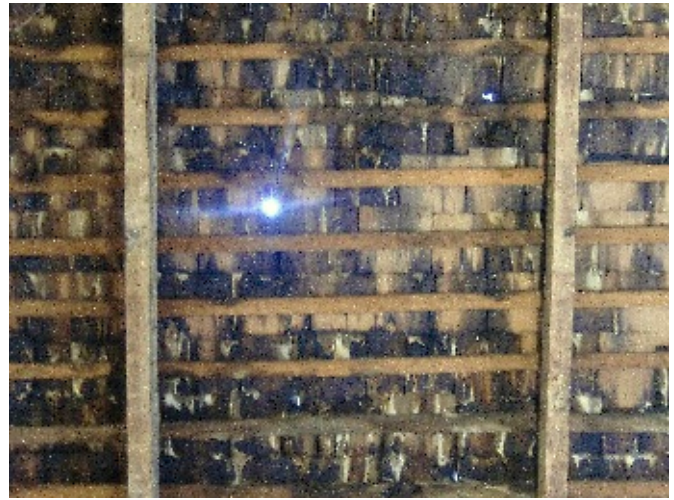
The interior of the old roof.

In 2012, NYC provided Capital Funding to restore the roof on the Onderdonk House. Current activities for continuing restoration and operational needs include modest admission fees, school tours and activity days, private research assistance and grounds usage fees for local events.