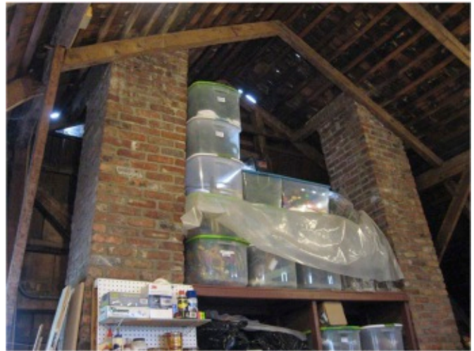
Main roof attic, looking west, with open envelope and water infiltration stains on chimneys.

product, a call was placed to Tony Bonura, CSSB District Manager, Northeast . The quality control committee learned that there were many factors to consider in a roof replacement project. These factors include condition of current roof, quality of replacement roofing materials and installation, accuracy of historical product type as well as product mill and treatment labels. The Certi-label™ product selected was Number 1 Grade Western Red Cedar