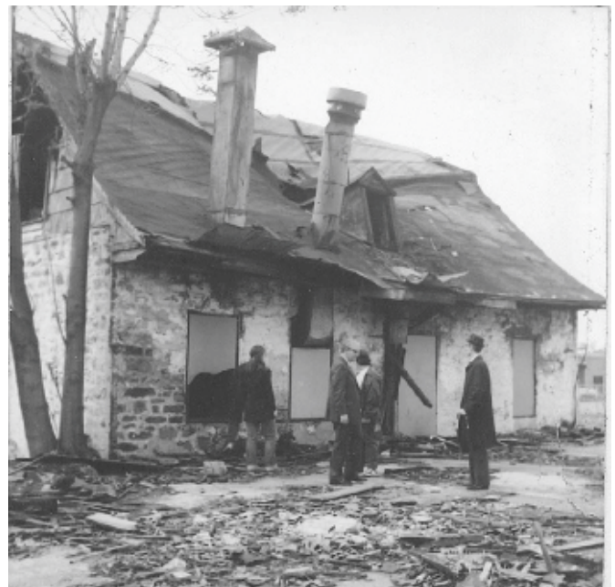
The Onderdonk House in 1975, after the devastating fire.