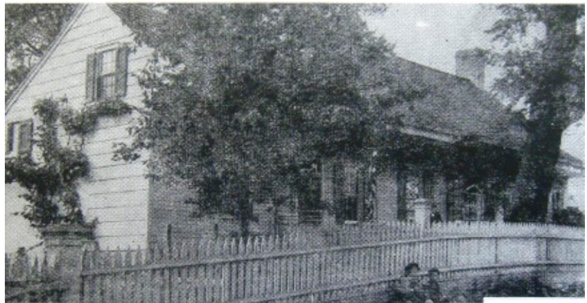
Onderdonk House in 1903.