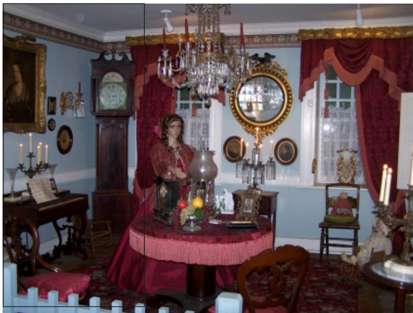
The Onderdonk House's Victorian Room.

American Civil War exhibit including period photos, currency and other memorabilia. Artifacts on permanent display include a butter mold, a child's wooden shoes, gallon bottle of Peppermint Spirits, salt-glazed stoneware bowls and bisque porcelain dolls. An interesting collection of bottles, in a glassed-in archway, are identified as soda bottle, Squibb medicine bottle ( Bristol-Myers Squibb was founded in 1887), rum, dazzle bleach, soda, medicine with measuring cup... many of which were found on the grounds and instantly show the house's connection to a fascinating past.