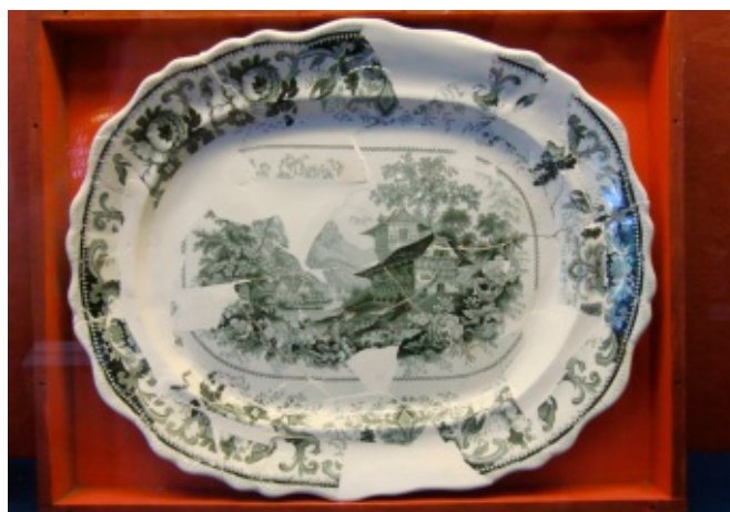
A serving platter unearthed on the grounds.