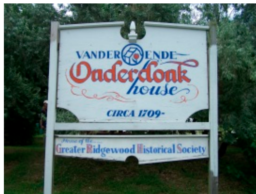
Welcome sign outside Onderdonk House.

Based in Queens, New York, the Greater Ridgewood Historical Society's mission is to save the "Onderdonk House" and exhibit the artifacts and history associated with this rare 18th Century Dutch American farm house. A dedicated team has uncovered fascinating objects and records of early American life. These are on public display in the many rooms of the Onderdonk House. Abandoned in 1970, in a middle class neighborhood, the house was in danger of being demolished. Local residents couldn't bear to let that happen to such an important part of their history. The unique Dutch-American 1.4 acre farm site, situated in Ridgewood (Queens), New York on the border of Queens and Brooklyn, deserved to be saved. Residents galvanized their efforts in 1975,