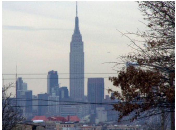
A skyline view of the Big Apple.