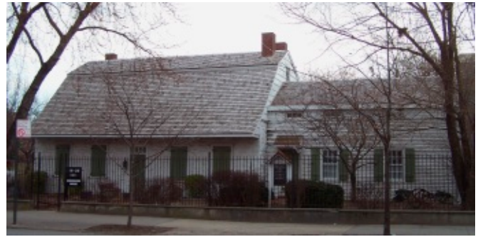
New roof one year later.