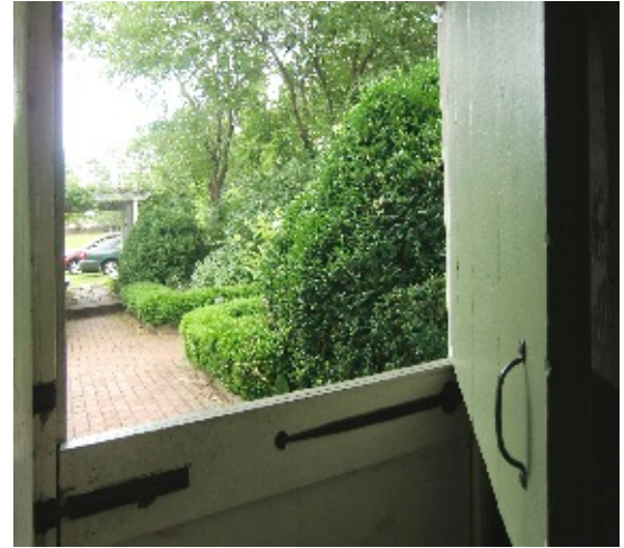
Half door to hedging and pathway.