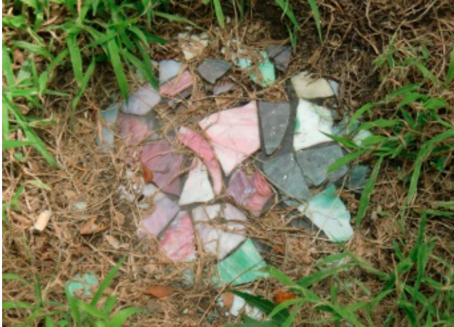
Reminders of past scrap glass business.

As the farming community along Flushing Avenue transitioned to commercial and industrial development, so, too, did the Onderdonk House. After the Onderdonks sold the house and property, the new owner operated a scrap glass business before "green" was in vogue.