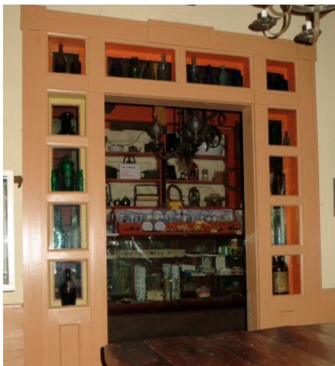
Archway of bottles between two rooms.

The Onderdonk House has developed a wonderful