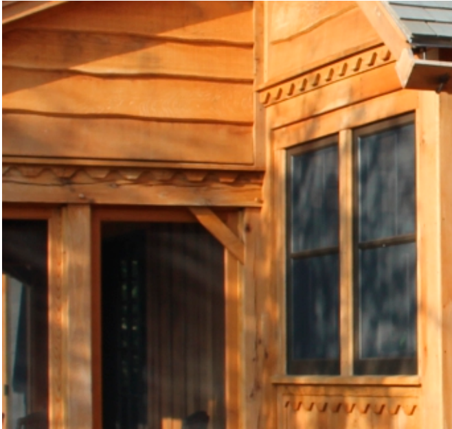
Creative carpentry details.

The home is a bibliophile's dream; inside the house are over 600 running feet of bookshelves. Built-in bookcases, configured in a variety of ways, are located in practically every room, whether in shared or private spaces. The owner's vast collection of books is well organized and displayed creatively throughout to further enhance the interiors while providing blended accents of color and texture. Generous amounts of natural light were planned to spill into the house to provide comfortable levels of illumination, most of the day, for reading.