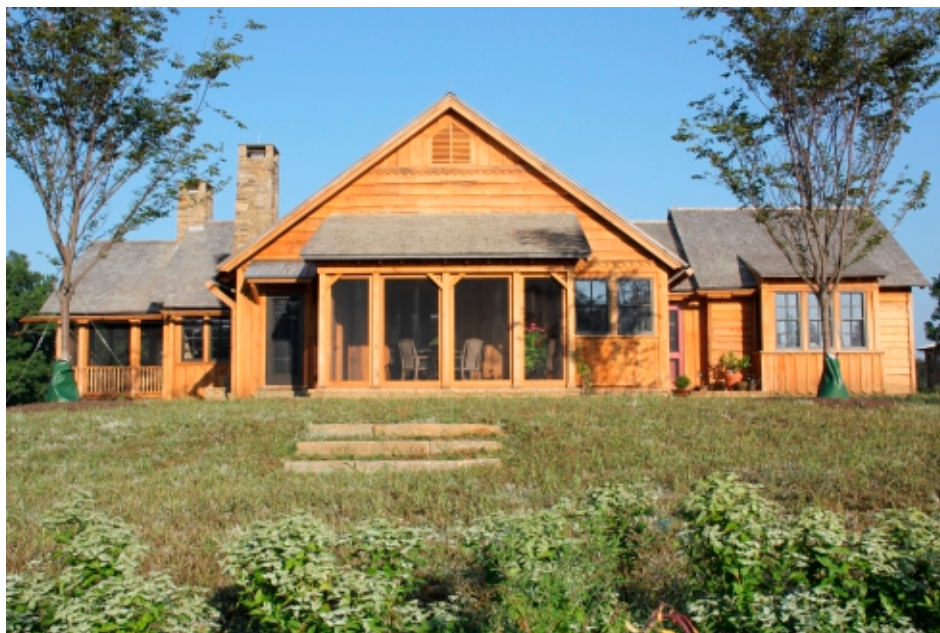
A beautiful, peaceful retreat.