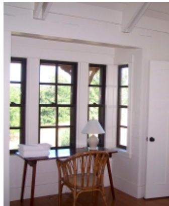
Campaign furniture desk.