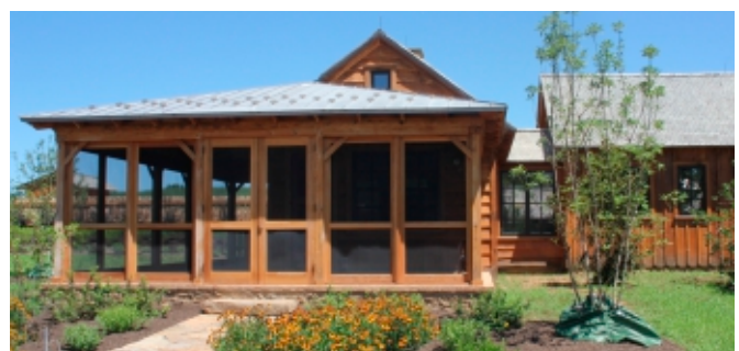
Pool house in front of lap pool.

The exterior unpainted siding, vast amounts of interior wood cladding and multitude of various exposed heavy timber applications all received as much study. To best accommodate the owner's request for a stable siding material that would offer a fairly predictable silver-grey appearance, many wood species were considered before white oak was chosen. Test panels were prepared to observe how the oak would behave when in contact with the elements. In the end, the client's desire to create a very rustic appearance was balanced with oak's expected weathering characteristics before finalizing the exterior details. Due to the extensive research and rigor of detail demanded by the project, Axelrod mentioned how the design and building team truly appreciated the many lessons learned about working with these materials on the way to realizing this remarkable project.