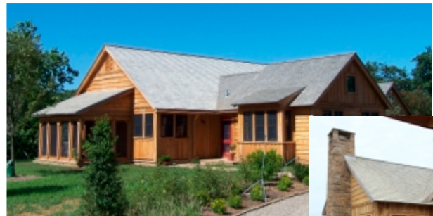
The newly finished home.

walked the property, the one thing that really stood out was how the original concept and vision were realized so accurately. Instead of test designs, drawings and mock-ups, one now sees completed structures with highly detailed exteriors and fully embellished interiors. Landscaping is underway and the buildings have been transformed into an intimate family village that says ‘welcome home’.