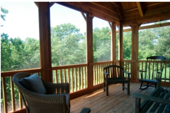
Spacious decks invite wide country vistas.