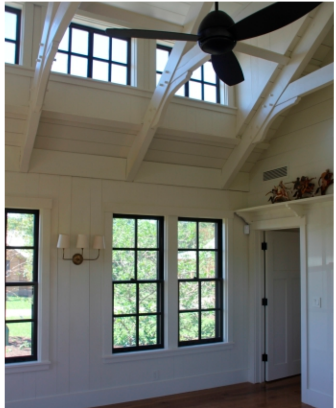
Custom windows were installed throughout the home.

Many areas within the main house and guest quarters were carefully planned to provide exacting display spaces for the homeowner's collection of distinctive European and North American artwork and antiques. Remarkable sculptures, paintings and oriental rugs all tell a fascinating story. The homeowners each possess a keen eye, and from day one, great emphasis was placed on ensuring that display spaces tailored to various groupings of their collection would be creatively incorporated into the project design. Blended tones of white for ceiling and wall paint provide a perfect field to allow the artwork and book collection to take prominence. Carefully designed lighting layouts, controlled digitally, further complement the displays. Certain antiques have been repurposed; an early 19th century carpenter's bench has been placed in the kitchen as a food preparation and baking island. A