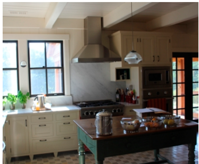
Repurposed antique carpenter's bench.

large wooden table with an inlaid coin slot and secret compartment, formerly used as an honor bar in a French Canadian tavern, serves as a unique dining table for 12. In a guest cabin, one can sit at a portable, British army campaign desk nestled into a bay window that offers sweeping views to the rolling landscape and stream beyond. Custom ledges, niches and shelves all are closely integrated with the architecture, and have their purpose to provide an array of display options.