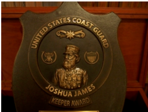
Joshua James Keeper Award

It takes a special team of people to demonstrate such courage. Joshua James (1826-1902) was a lifelong Hull resident. Born in the early 19 th century, it was James who could “hear the land speak” by listening to the sounds of various waves slapping against the shore. James made up his mind to dedicate his life to preventing shipwreck drownings after his own mother died at sea. He joined a local Humane Society crew and spent six decades saving lives.