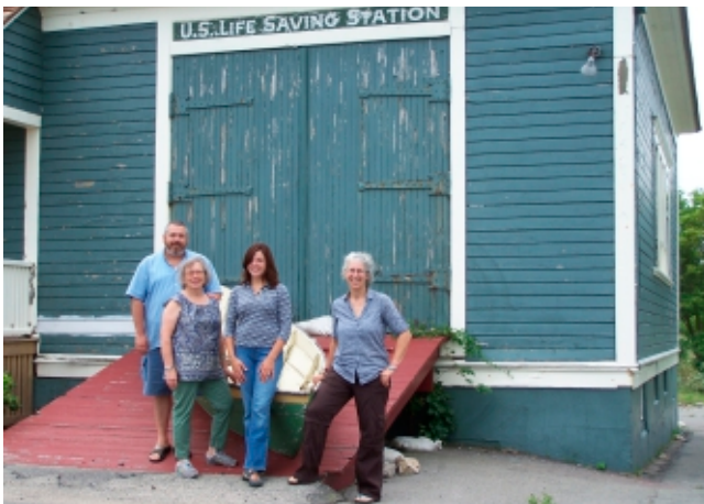
Enthusiastic and capable museum staff