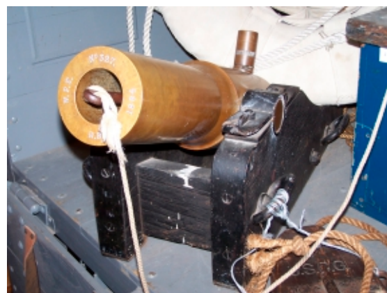
Historical lifesaving rescue equipment

Much like the multi-generational cedar shake and shingle industry, lifesaving careers tend to run in families. Several notable families from the area contributed to the success of the lifesaving efforts over the years. The Hull Lifesaving Museum is a treasure trove of seafaring artifacts, including old photographs, rare postcards, paintings, sea charts, log books and actual ship rigging and equipment. Several Humane Society medals are on display, kindly donated by the families of the brave men who ventured out into choppy, unforgiving seas. A tour through the museum ensures one is deeply immersed in the unique and daring life these men chose.