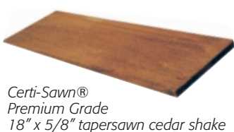
Certi-Sawn® Premium Grade 18" x 5/8" tapersawn cedar shake