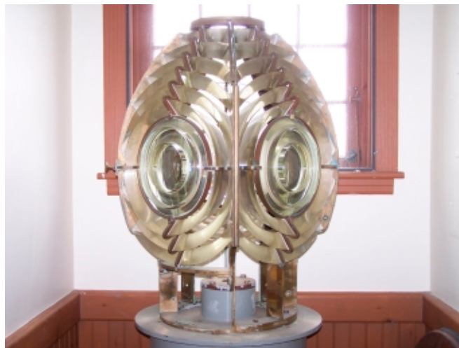
Fresnel lighthouse lens

interfere with museum visitor schedules. One of the particular challenges was to build a plywood box that encapsulated the Chance Brothers Co. Limited Lighthouse Works 1902 Fresnel lighthouse lens, which is a massive (and heavy) museum object on display in the boardroom. Too big to move, this plywood chamber was a creative solution that amply protected a treasured piece of history.