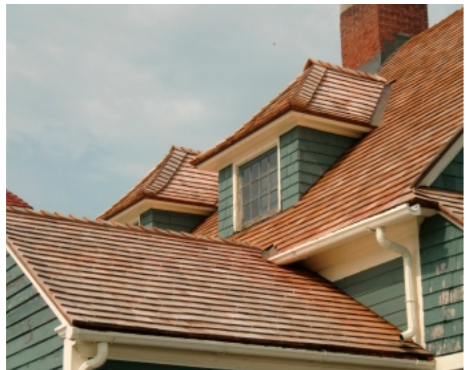
Traditional lifesaving station roof design provides a navigational landmark

Placed on the National Register of Historic Places in 1981, the museum welcomes over 15,000 people a year. The late 19 th Century building is one of 15 “Bibb #2 shingle style stations”, named after famed architect