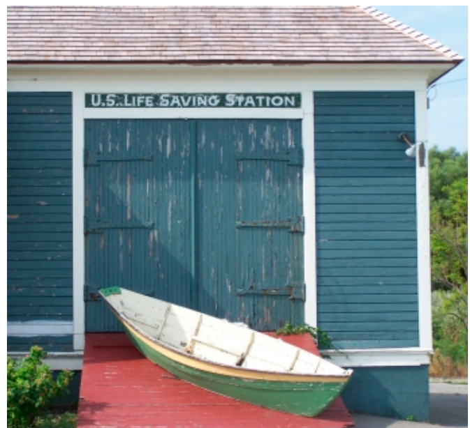
Authentic rescue boat outside museum

easy, especially in an era where ships were all under sail, rather than on reliable engine power. Thankfully for sailors, the Hull lifesavers were a dedicated team. There are many stories of rescues where thankful sailors were taken to shore, given warm, dry clothes and food... mere hours later they would find their ship battered apart, reduced to broken wooden planks bobbing along the shore.