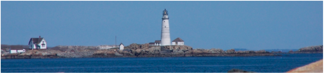
Famous lighthouse across the narrow channel