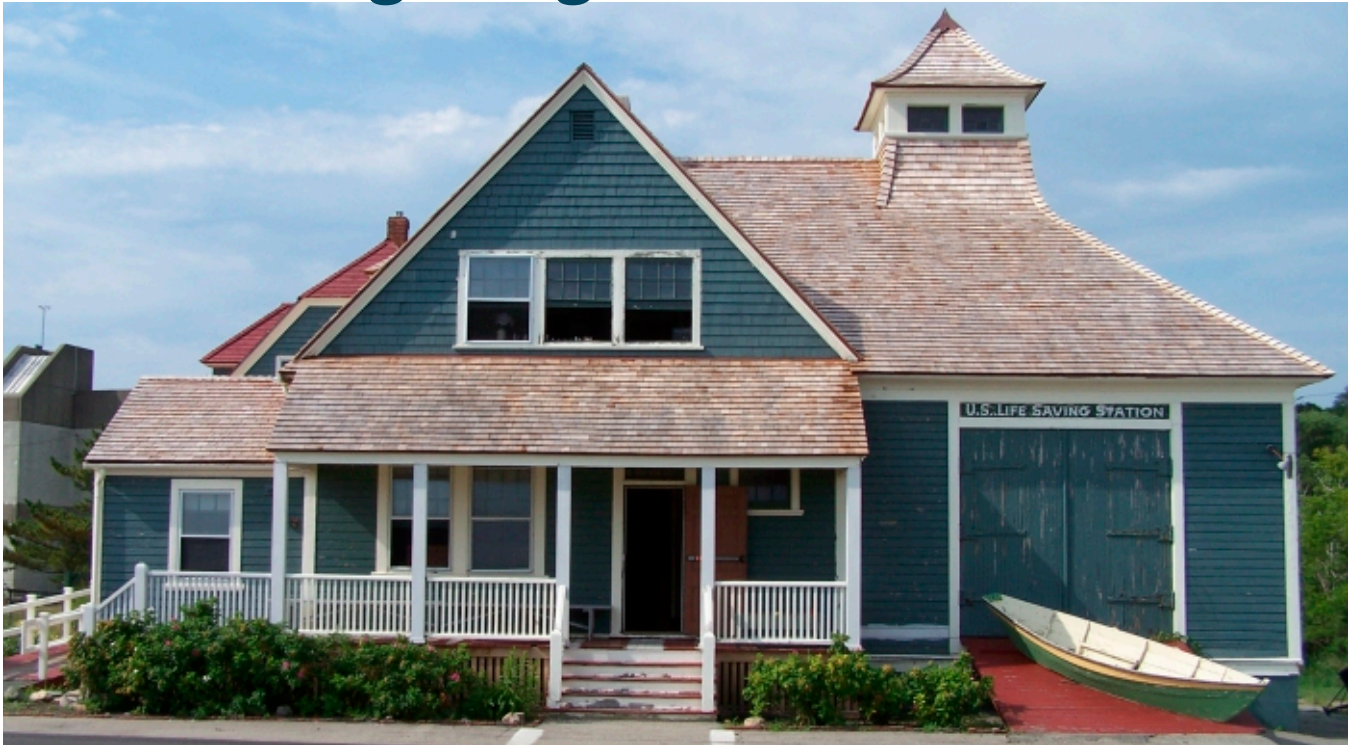
HULL LIFESAVING MUSEUM, HULL, MASSACHUSETTS