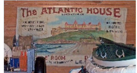
Historical Banner inside Museum

Today more modern coast guard equipment rescues sailors in trouble. Engines make a world of difference compared with ships under sail power. After James' time, the Boston Harbor opened up another wider,