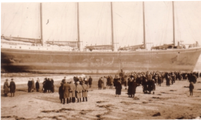
The Nancy run aground.

Of particular historical importance is The Nantasket , a 29-foot long surfboat with 10 rowing stations and a big, bluff bow. Her initial design was the subject of much debate; old salts called her too heavy and not maneuverable in rough, icy waters. They felt justified in their concerns as the men not only had to plunge into dangerous seas... they first had to tow their vessel out across the road and rocky shore, then launch her into the surf. The Nantasket proved her disbelievers wrong during one icy storm... the Great Storm of 1888. Not only did she save multiple crew members of a wrecked schooner, she also navigated the rough seas with temporary patches glued to her battered sides.