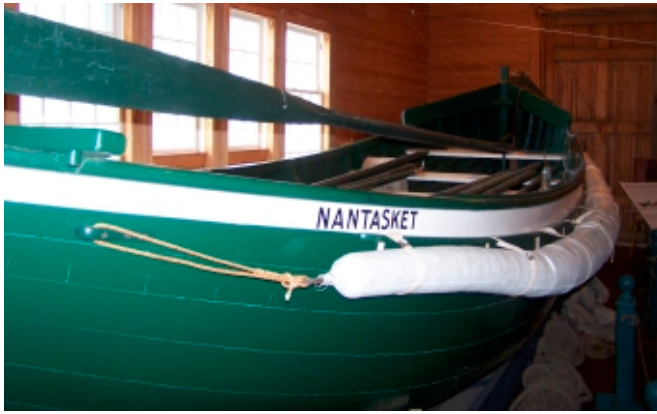
The Nantasket, famous surf rescue boat