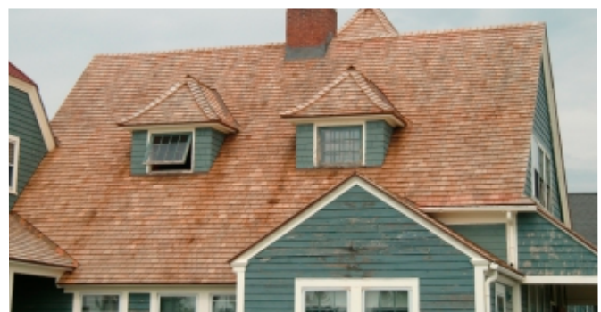
The beautiful new Certi-Sawn® roof

Today the Hull Lifesaving Museum runs a popular apprentice program in marine trades for at risk youth. Giving young adults hands-on experience goes a long way to refocus their lives towards positive outcomes. Of particular note is the hands-on boat restoration work with low student to teacher ratios. It's a win win opportunity as the students also provide repairs to the marina, as well as furniture restoration and sales. Other programs associated with the Hull Lifesaving Museum include children's summer camps and 4 or 6 oarsmen boat training, old style. Guided tours, during opening hours and by appointment for special groups, are also available. Museum staff's 'can do' attitude ensures that this facility is a thriving hub of activity where there's something for everyone to enjoy.