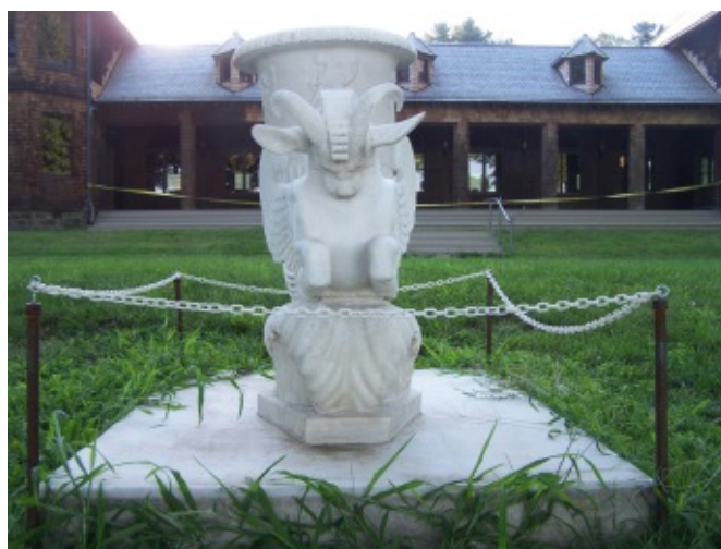
Sculpture in front of bowling alley.

Lyndhurst Estate stands proud today, a reminder of what once was, as well as offering an experience that future generations will certainly cherish. Whether one admires the faux marbling craftsmanship, secret drawers in a unique travel desk, the intricate plaster work, the Gothic revival architecture or simply wonders at the splendid landscaping accentuated by weeping beech trees... Lyndhurst has something for everyone. The Cedar Shake & Shingle Bureau offers its sincere appreciation to both trustees and staff for their careful stewardship that ensures Lyndhurst remains a viable, treasured estate for future generations to enjoy.