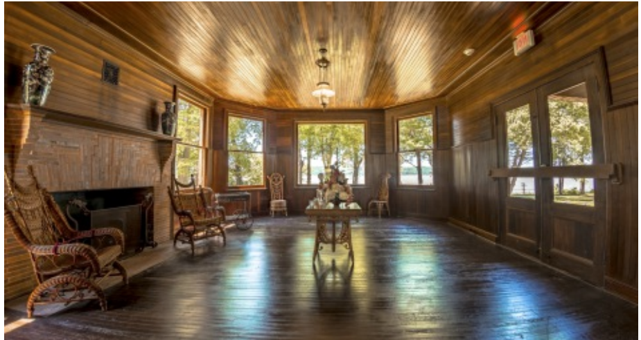
Upstairs sitting area above bowling alley.

In 1894, Helen Gould commissioned the building of a bowling alley and recreation pavilion located within 500 feet of the banks of the Hudson River. Believed to be the oldest regulation two-lane alley in the country, this structure served not only the family's entertainment purposes but as a location for sewing school that served thousands of children from the surrounding community. When the estate passed to Helen's