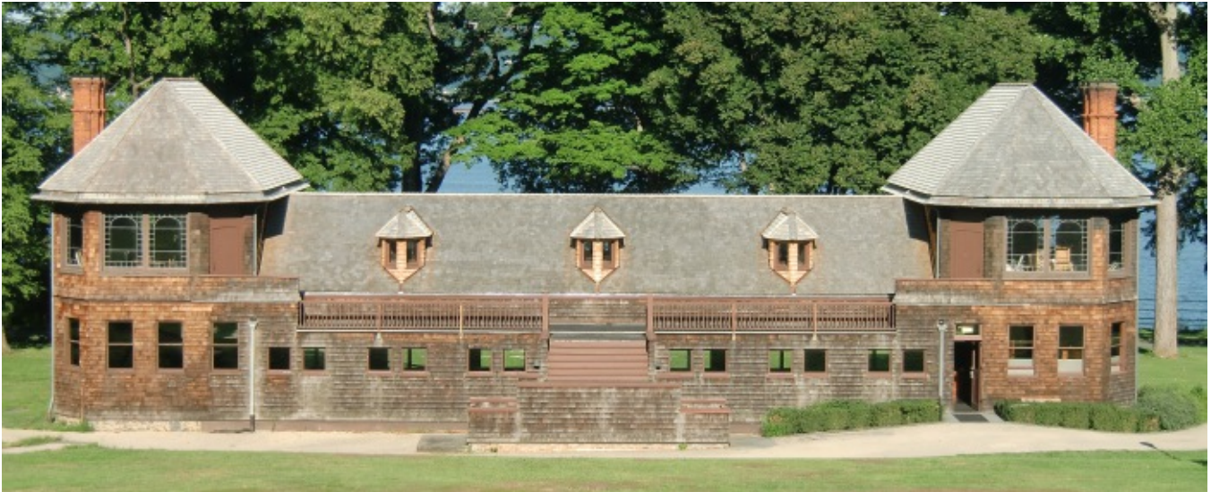
Exterior of bowling alley.