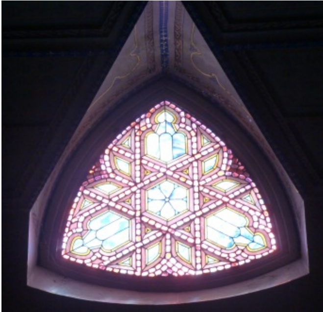
Guest bedroom pink stained glass window.

Academic paintings acquired by rail road speculator Jay Gould and his children specifically for Lyndhurst .