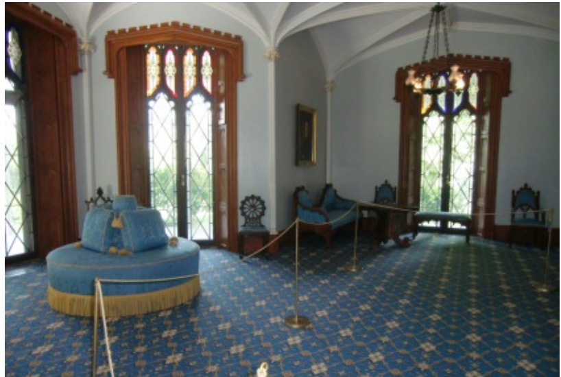
Parlor c. 1842 décor.

The bowling alley is unique in that it has self-levelling lanes that allow for seasonal changes in the maple lanes. Most bowling alleys from this time that survive are found in the basements of mansions and glued down to a cement floor. The last piece of work