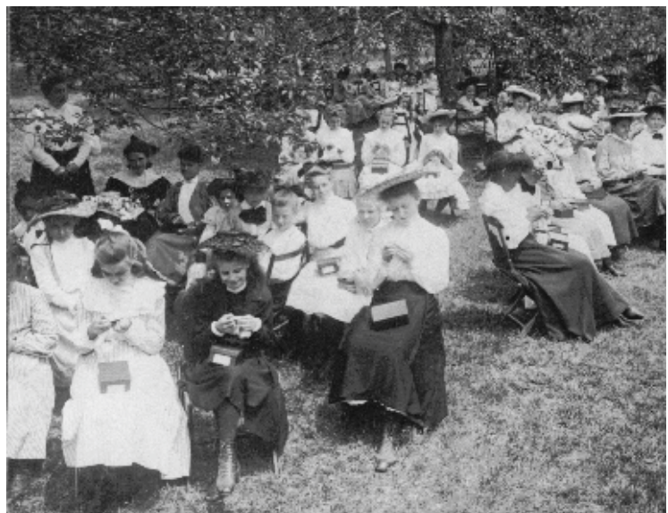
Sewing School graduation.

hired a French chef to lead the cooking school, and brought professional teachers in from New York City to teach sewing and tailoring. Determined to provide Lyndhurst servants' children with better career opportunities than their parents, Helen Gould's vocational schools graduated as many as 300-400 students a season for more than 20 years. The archives contain samplers and graduation pins made by Tiffany & Co. that were gifts to the students. Her commitment to enriching the lives of those less fortunate in her community was cemented by the fact that the greenhouse's vast collection of exotic plants were open all who wished to see them every day but Sunday. Much to her credit, Helen Gould blazed an impressive philanthropic course which leads us to the Certi-Sawn® cedar shake project Lyndhurst undertook.