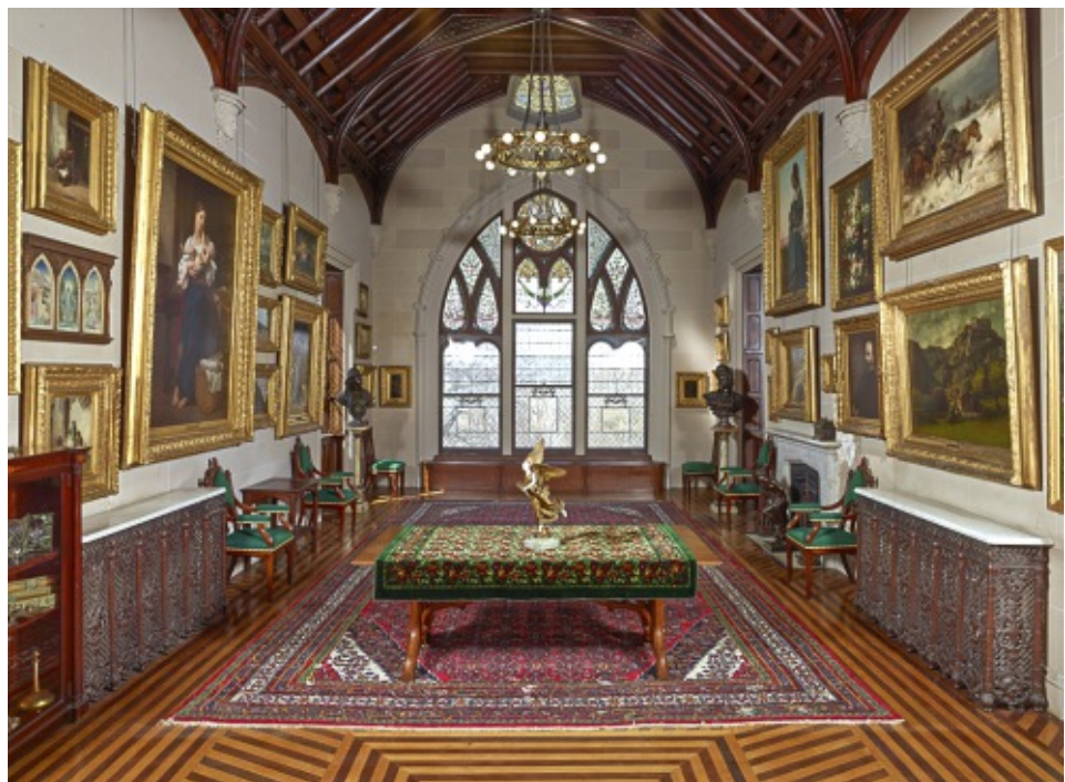
A lovely picture gallery.