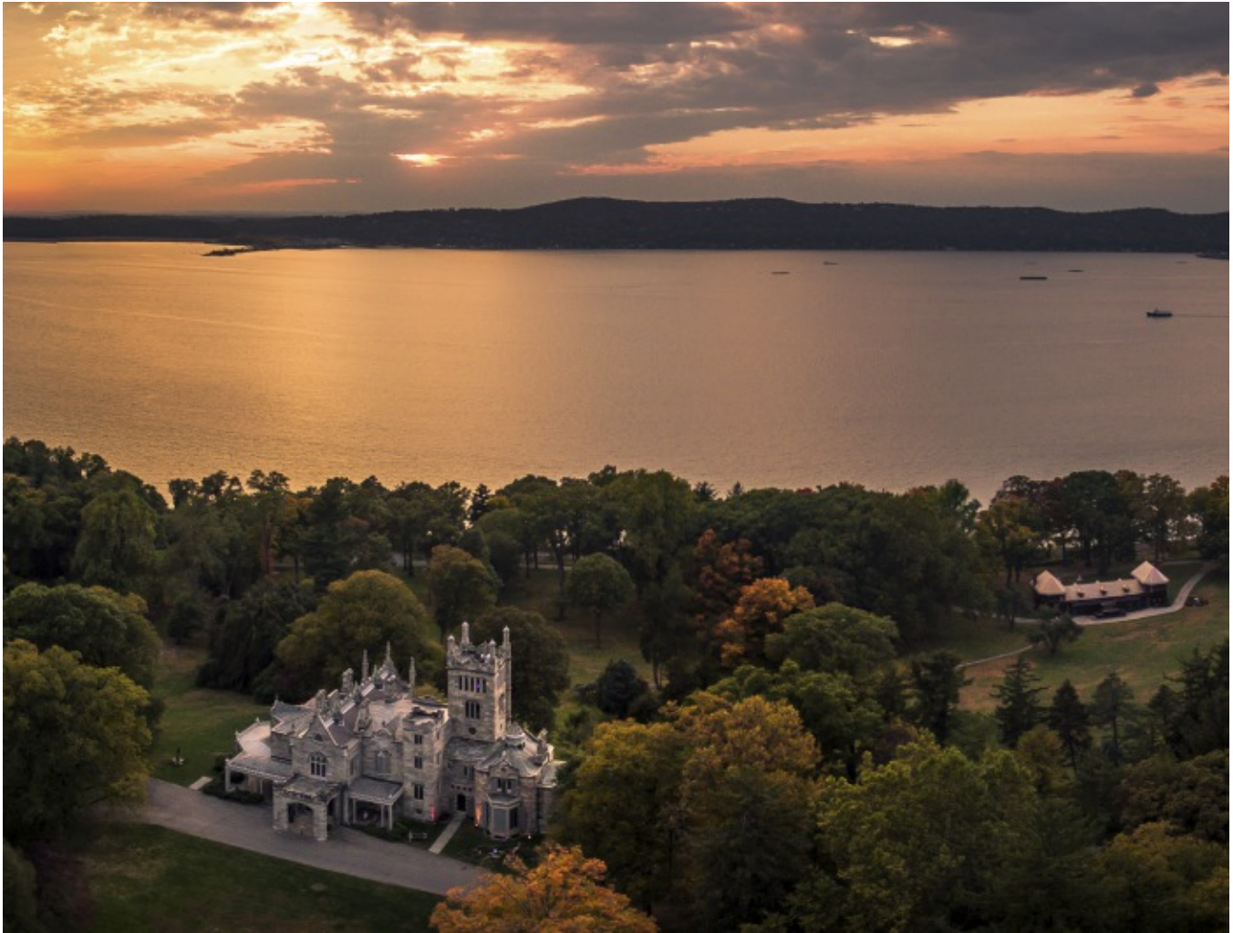
Aerial view of Lyndhurst Estate.