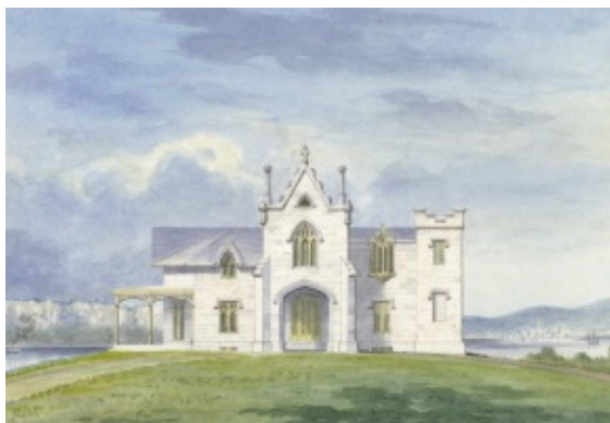
Original watercolour for Knoll/architectural design.

A winding drive lined with ancient trees is the prelude to a 67-acre estate that proudly overlooks the Hudson River in New York State. Located thirty miles north of New York City and five minutes from where Ichabod Crane had his famous encounter in Sleepy Hollow, Lyndhurst is a beautiful, National Historic Landmark property that is a delight for all the senses. It is indeed a rare opportunity to visit a site where a Gothic revival mansion overlooks a bevy of dedicated-purpose outbuildings, one of which is a cedar shake-clad bowling alley built in 1894. Rarer yet is the high level of dedication and devotion to historic preservation