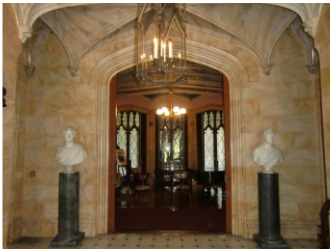
Yellow faux marble.

Constructed to emulate the medieval Gothic style, it is key to note that this form of architecture celebrates asymmetry. One of the most stunning displays of