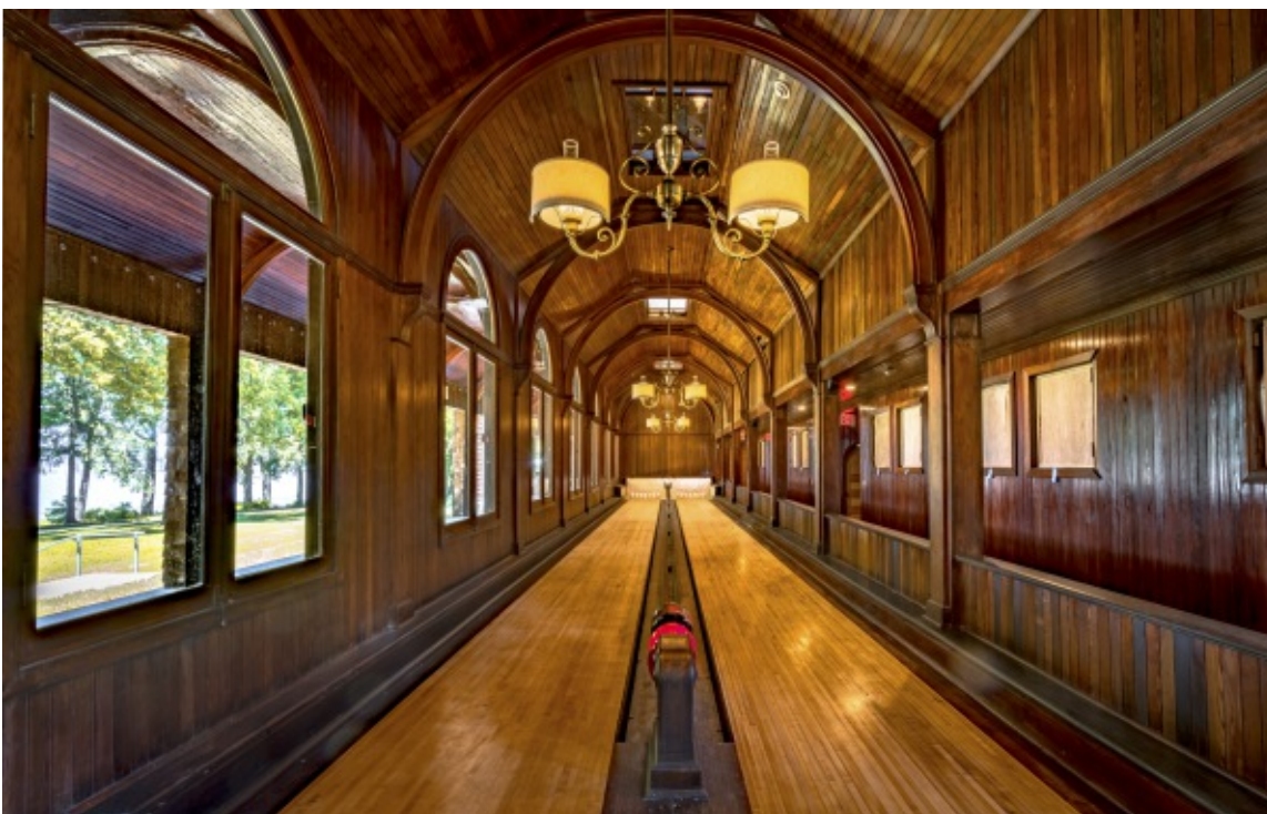
Restored bowling alley.