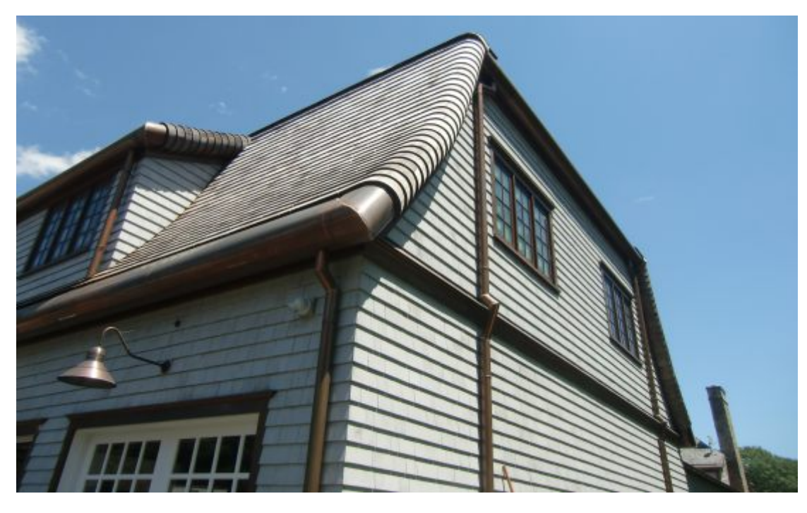
Extensive custom copper work is another example of expert craftsmanship. Rolled tapersawn shakes at roof rake edges are unique to the area.