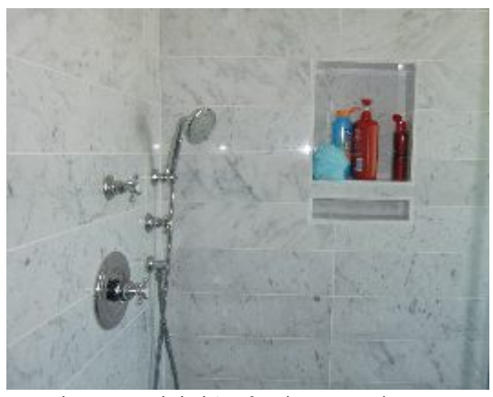
Note the recessed shelving for shower products.

Each of the three sons has their own ample sized bedroom with full en suite. Shower stalls have built in recessed shelves that are so very smart for shampoos and shower gels. The master bedroom has built in his and her closets, with wonderfully large storage shelving for shoes. Rainfall shower head and freestanding tub complete the relaxing spa-like master bathroom. With ceiling heights ranging from 12-14 feet due to the gambrel roofline, residents can stretch out and enjoy glorious space throughout the home. Outside the master bedroom is a mahogany deck with stainless steel cord railing; comfortable outdoor furniture and a sunny flower design table make for a relaxing sitting area.