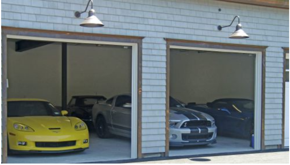
A 14 car garage is the envy of all car enthusiasts.

family member's passions, a new residence is created to satisfy every need. At the heart of every home is family, and this residence is clearly focused on the importance of spending time together.