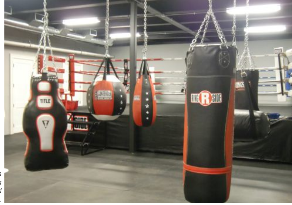
With a bowling alley, theater room and boxing ring, the home offers a multitude of unique exercise and entertainment options.