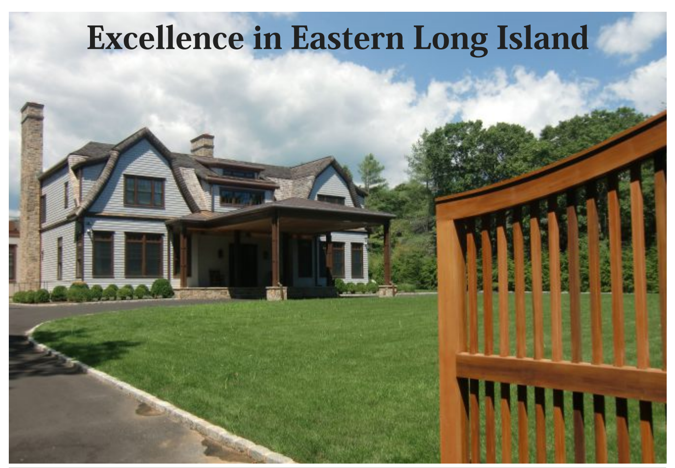
EASTERN LONG ISLAND, NEW YORK