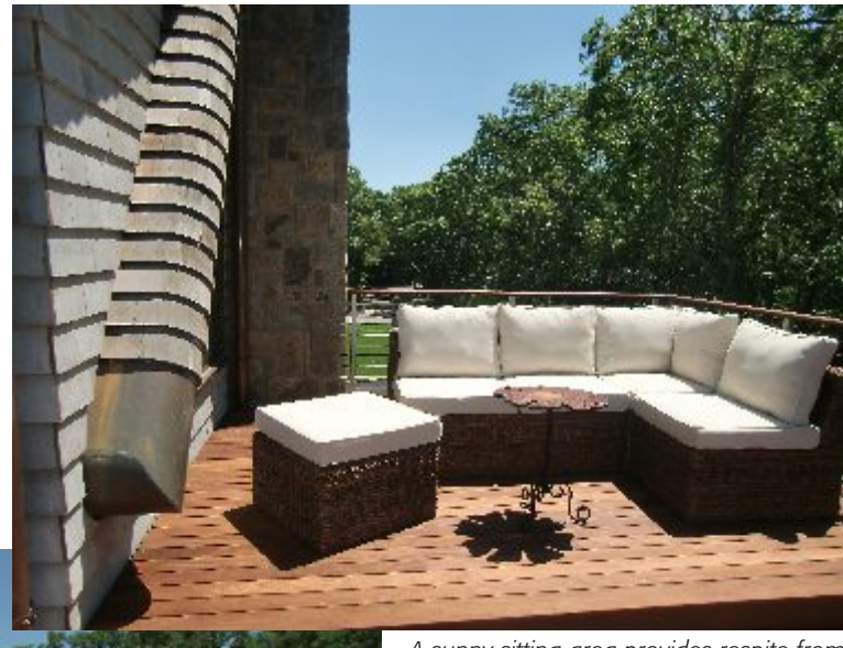
A sunny sitting area provides respite from a busy day.