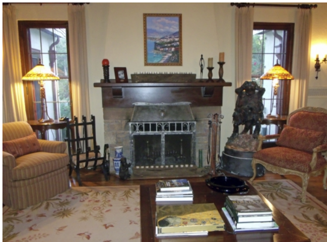
Cozy living room