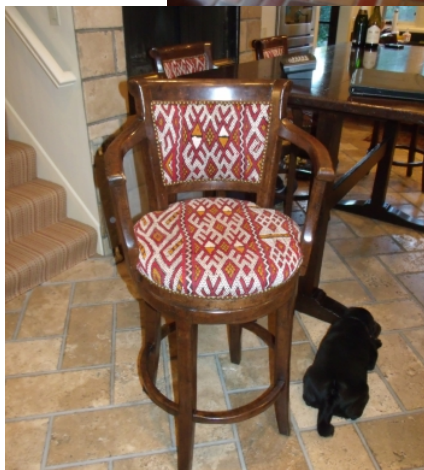
Bar stool upholstered with Moroccan tent material