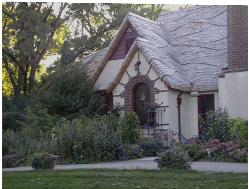
Lush country setting

the monarch himself. Gentle, green, rolling hills frame peaceful country fields. The Cotswolds is well known as a wonderfully romantic area, an excellent place to enjoy a fancy cream tea, a haven for artists, hikers, gardeners, birders and antiques. This home and its Certi-label™ roof capture the area's best traits on one lovely acreage.