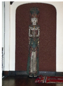
Good luck statue

This cozy home is filled with the homeowners' wonderful mementos from travel all over the world. It's made even more special with the interior finishing work created by specialty ironworkers and stoneworkers. The ironwork is of Italian design. Imported tiles cover the dining room floor. Reclaimed tobacco barn flooring sourced from South Carolina is found in other