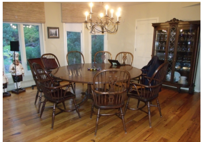
Reclaimed tobacco barn flooring