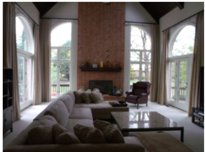
Gorgeous living area

family's favorite room in the house, likely because the warmth that beams in from outside is akin to the joy they receive from giving back to the community.