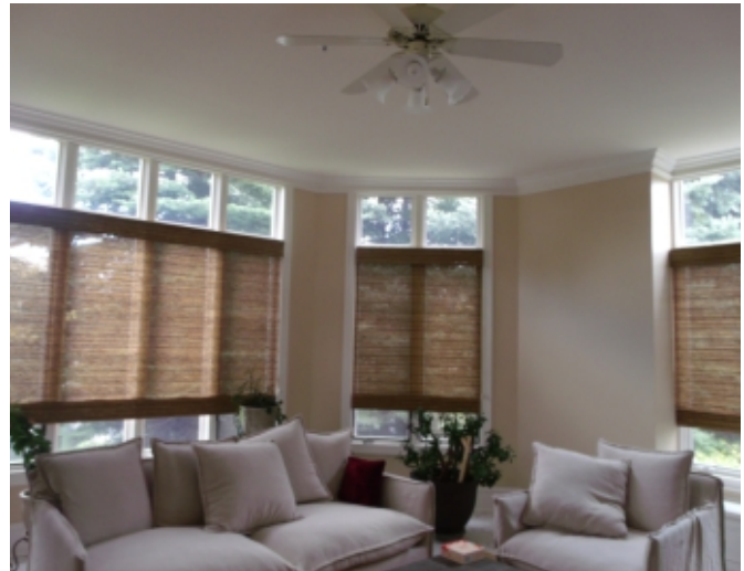
Space for relaxation

has lived in the home for over eight years and thoroughly enjoys the peaceful two acre lot. The owners are truly kind, caring people who really try to better other people's lives. The sunroom is the