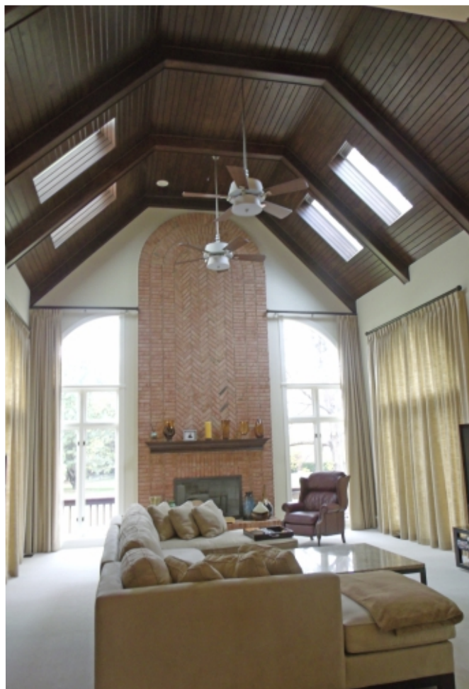
The Great Room with Velux FS skylights

removed. Countryside offered a different solution, much more economical than reworking the wood ceilings after the proposed skylight removal and roof fill in work. Instead, Countryside recommended installing Velux FS skylights which contain low E glass and solar powered sun blocking blinds. The solar-powered skylights eliminated the need for an on-site electrician for installation.