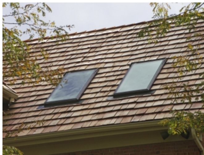
Complex skylight challenge