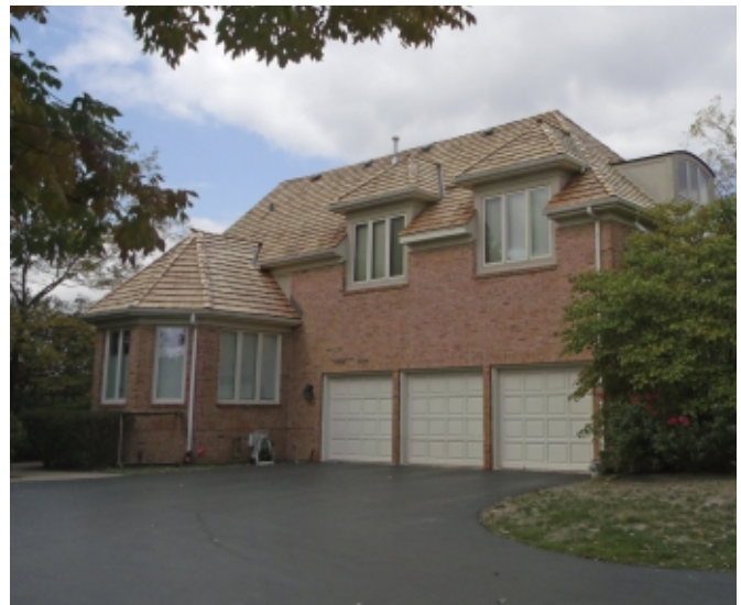
Rear of house

the start and this is why Countryside was successful in its reroofing proposal. The firm has a 20+ year history with