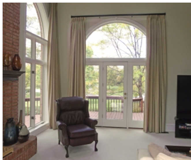
Living area (both photos in this column)