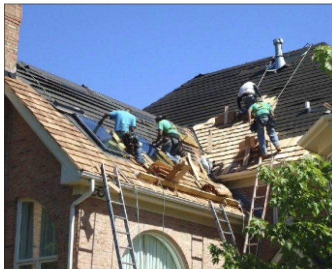
Countryside crew at work

not visible to the eye, Clinge stated, "... even though no one will ever see the work, I'll know."