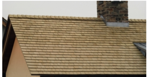
A finished Certi-Sawn® yellow cedar tapersawn shake roof