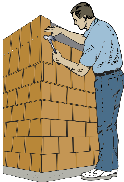
Figure 9: Fitting Laced Corner Courses