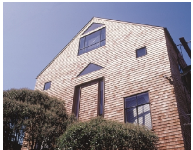
Architect: Tanner and VanDine Architects

Note: Keyway spacing between Number 1 Grade Certi-label Western Red Cedar shingles shall be 3mm – 16mm; Yellow Cedar shingles shall be 6mm - 10mm.