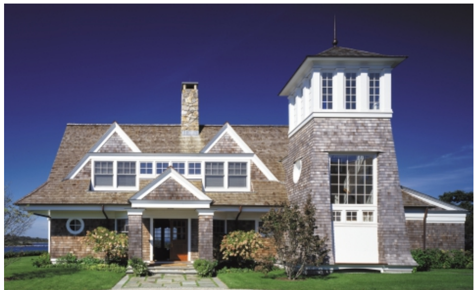
Architect: Shope Reno Wharton

Currently the only acceptable solid sheathing product tested for use with Certi-label shakes is plywood.