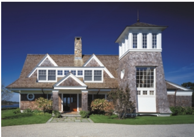
Architect: Shope Reno Wharton, Photo: Robert Benson

Note: All figures depict shingle applications. DO NOT interlay shingles or shakes with felt on sidewall applications.