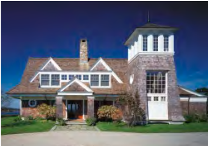
Architect: Shope Reno Wharton