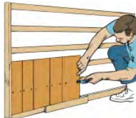
Figure 17: Starter Course