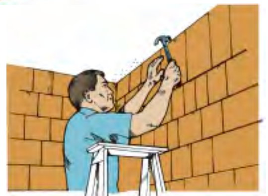
Figure 19: Top Course

The interior Certi-label Western Cedar shingles or shakes can now be finished to suit almost any taste. Contact a reputable finish manufacturer for more details.