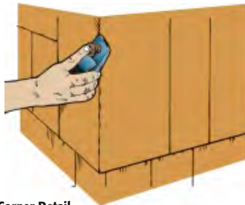
Figure 18: Corner Detail