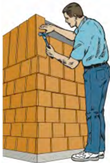
Figure 9: Fitting Laced Corner Courses