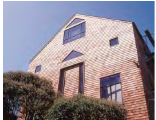
Architect: Tanner and VanDine Architects