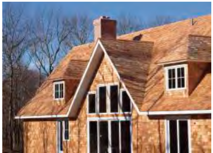
Architect: 3D Building, Photo: David Reeves Studio, Inc.