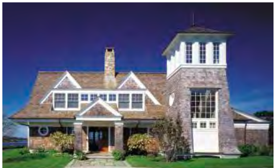
Architect: Shope Reno Wharton