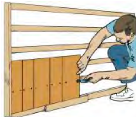
Figure 17: Starter Course