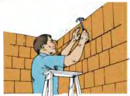
Figure 19: Top Course

The interior Certi-label Western Cedar shingles or shakes can now be finished to suit almost any taste. Contact a reputable finish manufacturer for more details.