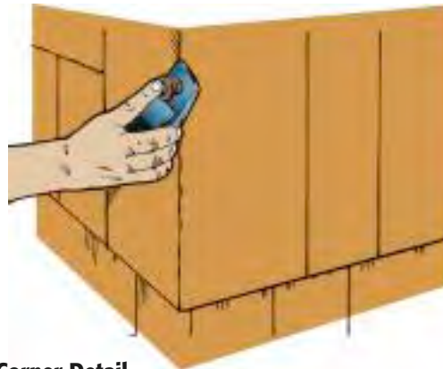
Figure 18: Corner Detail