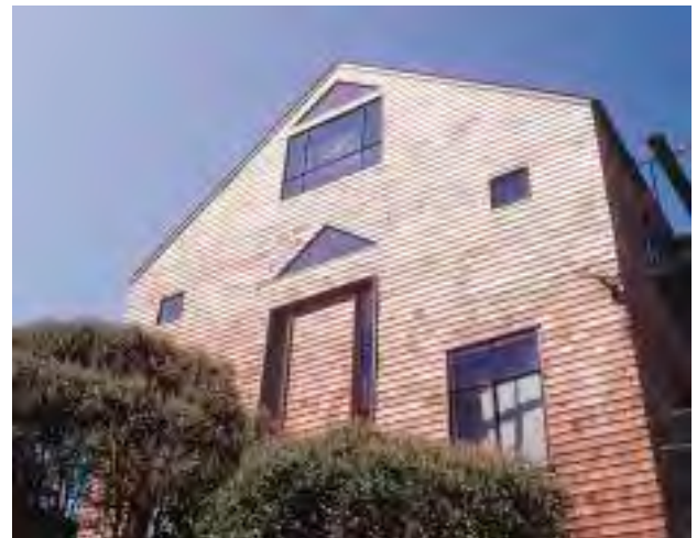
Architect: Tanner and VanDine Architects