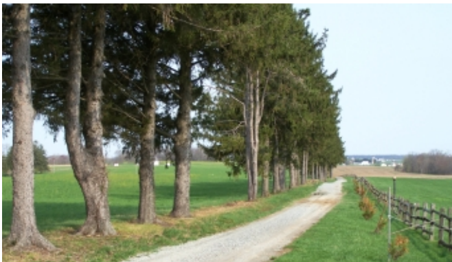
Tranquil, tree-lined drive en route to a unique family retreat

Set deep in the heart of Lancaster County, Pennsylvania, is a project that rapidly attained the title Celebration of Wood . True to the 140 acre farmland property's roots, this project was designed from the start to showcase the natural beauty of forest products.