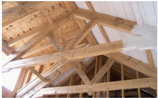
Partial finish work on ceilings is complete

Smiles continue when discussing wood's superior insulation qualities and environmental friendly aspects. This project will actually have an R-value that exceeds state building code. Wood ages gracefully over time, and this is one of the key reasons why the owners chose wood as their building product of choice. The concept of having a home that immediately blended in with the land greatly appealed. No other building product offered the dignified weathering or the deep character of wood.