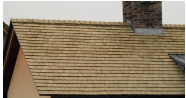
A finished Certi-Sawn® yellow cedar tapered shake roof