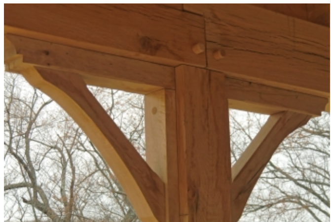
Heavy oak timber beams will age gracefully in place, exactly what the owners wanted

One only has to step a few feet over the chunky clay and shale to experience real craftsmen at work. They love the opportunity to create something special with Mother Nature's finest stone and wood. Elements that make this project unique are the numerous types of trim and siding designs that are discussed on a weekly basis. No compromises are made and a full discussion amongst architect, builder and owner is completed to the team's satisfaction. Everyone works with a high level of trust, and having the opportunity to observe teamwork in action is a pleasure and is a great thing to learn from this case study project.