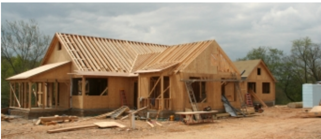
Framing work is well underway

Geothermal heating and domestic water wells have been located carefully below grade as are special storm water management systems. A filtration system was installed for drinking water; unfiltered storm runoff will emerge from external spigots used for landscaping needs. An intricate spider web of pipes and connections are organized underground to provide an aesthetically pleasing landscape. Backup propane generators are delicately concealed behind rock walls and provide a much needed tandem system for the frequent power outages in the area. A lightning protection system was also installed.