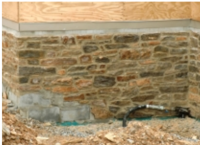
Natural stone siding will cover part of the walls, blending in perfectly with the natural surroundings

A neighboring, century-old woodworking mill with a reputation for superior craft was selected to manufacture the highly detailed windows and doors. A local quarry, known for its distinctive, earthen-toned rock, will provide the stone needed for exterior walls and true masonry fireplaces. Hand molded clay brick was chosen from a set of 30 choices to achieve just the right color that blended in with the natural wood and stone.