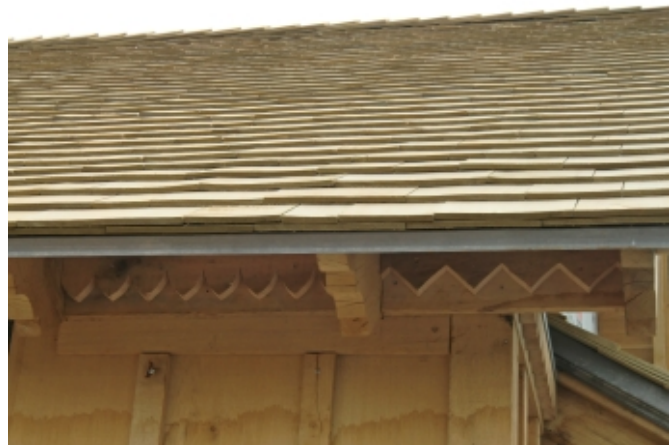
Mock up detail work ensured the perfect selections were made