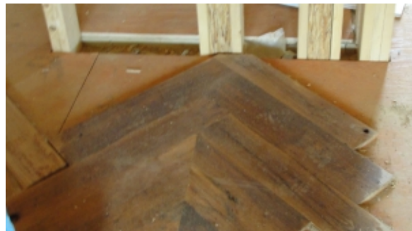
Reclaimed chestnut plank flooring was selected for this project