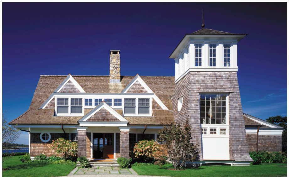
Architect: Shope Reno Wharton

Currently the only acceptable solid sheathing product tested for use with Certi-label shakes is plywood.