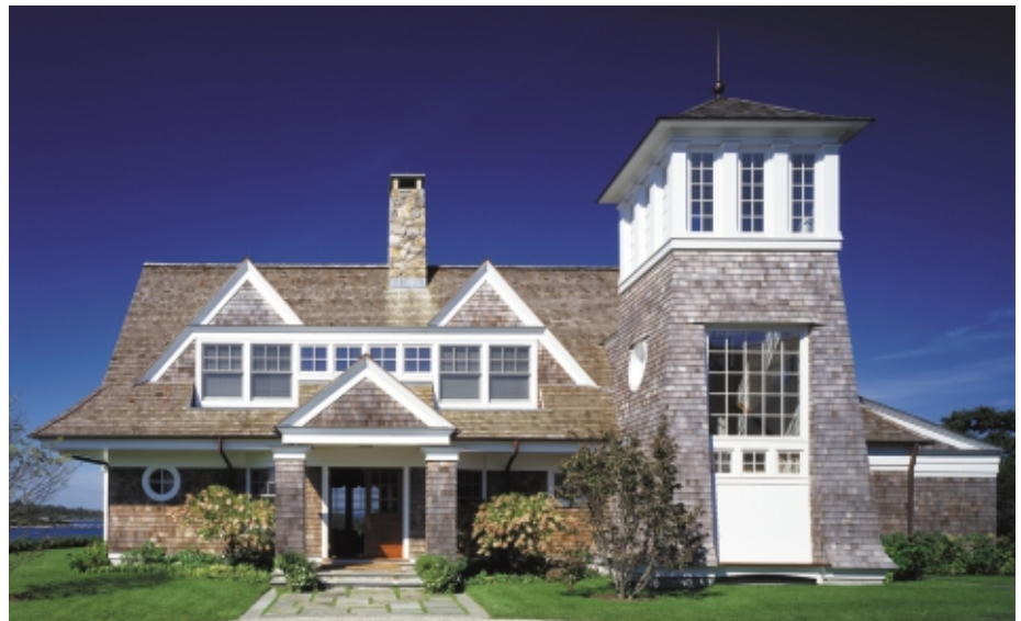
Architect: Shope Reno Wharton