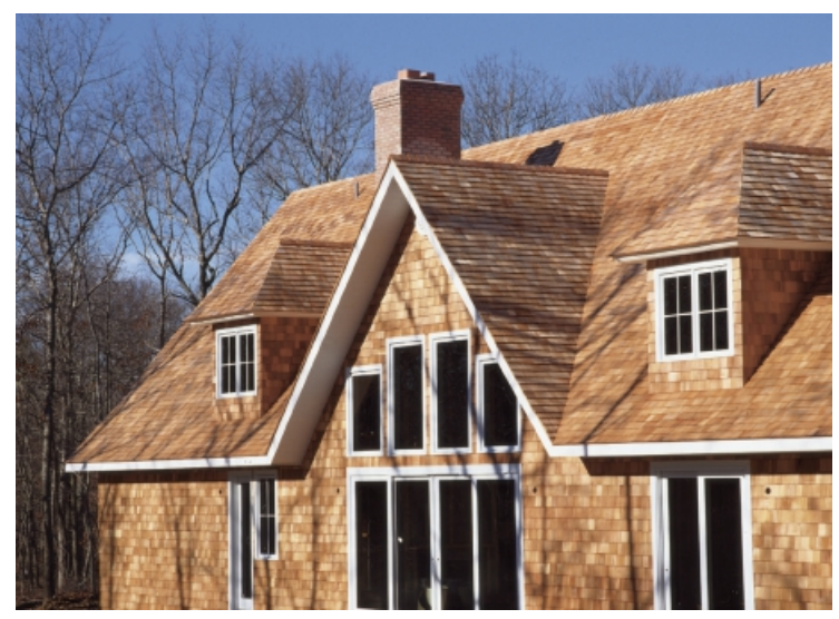
Architect: 3D Building