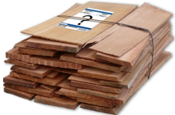
Off-grade, non-code-compliant bundle